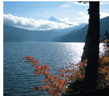
Bull Run, the District's water supply source for over 100 years.

4) West Slope and Social Media You may have seen comments on some social media platforms that West Slope was working on a merger with another water system. Like many things on social media, there is no truth to those rumors. As a rule of thumb, if we are not talking about an issue here in this newsletter, on our website, or in our Board meetings, it isn't an issue to West Slope. One of our core values is to be transparent in our activities, and we take that seriously.