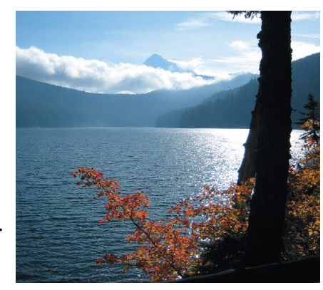
Bull Run, the District's water supply source for over 100 years.