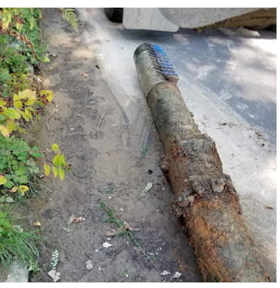
SW Garden View Drive pipe replaced during main break in 2022.

The Next Water Main Project! Our attention now turns to our next capital pipe replacement project on SW Garden View Drive, between SW Canyon Road and SW Scenic Drive. With our engineering design consultants, we are starting the design for a new water main to replace 2,100 feet of 8-inch cast iron water main installed in the late 1940s and early 1950s. The area we are working on is the site of the large water main break in August 2022. Our design should be complete in early Fall 2024, and we are anticipating that construction could start in November 2024. Local traffic will be allowed to travel on SW Garden View during construction, but we will also be working with Washington County Transportation for a detour route for "passing through traffic" during construction. More on the short-term impacts to our customers as we get closer to the end of summer.